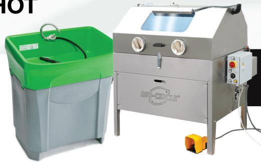
BIO-CIRCLE GT Maxi & HP VIGO